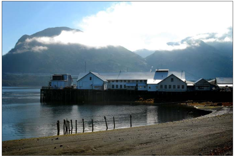
A Metlakatla cannery, which closed in the 1990s, now operates as a cold storage facility for local fish products about to be shipped out. The facility is run by the Metlakatla Indian Community.

In other ways, Metlakatla's population doesn't differ much from the statewide average. For example, among the population age 25 and older, 91 percent in Metlakatla have a high school diploma, about the same as Alaska's 92 percent. Attainment of college degrees, including associate degrees, is lower at 14 percent in Metlakatla and 36 percent statewide.